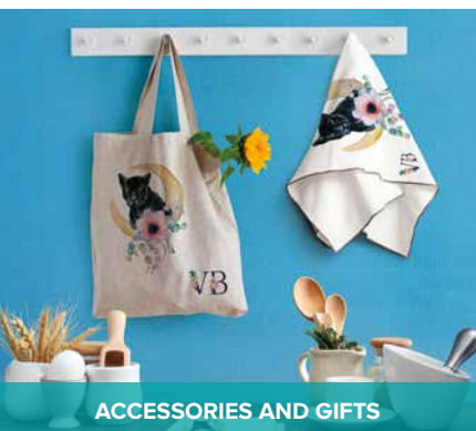
ACCESSORIES AND GIFTS